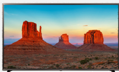
55" UHD 4K TV

So how can you help? METRO has 200 raffle tickets to sell, or give, to our generous members. Not only will METRO donate half the proceeds to CU4Kids, but you will also be entered into a raffle for a NEW 55" 4K TV & BLUETOOTH SOUND BAR!